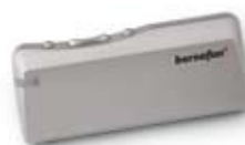
RC-P remote control