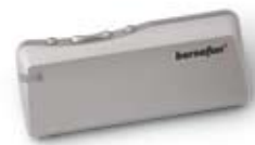
RC-P remote control