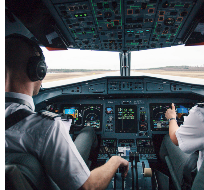
Ideal for occupational health professionals