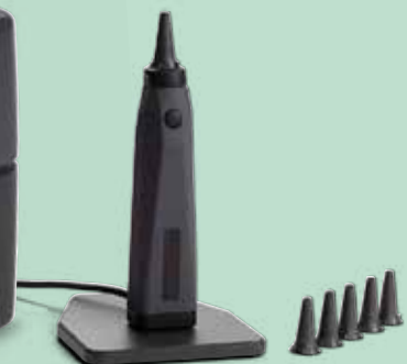
Viot™ video otoscope offers full integration in the Callisto™ Suite