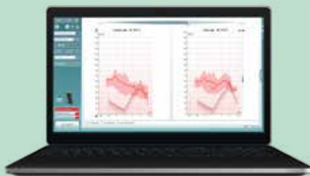
Visible Speech Mapping (optional)