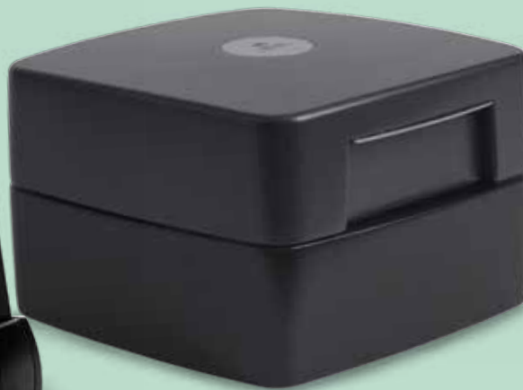
TBS10 test box for Hearing Instrument Testing