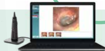
Viot™ Video otoscope