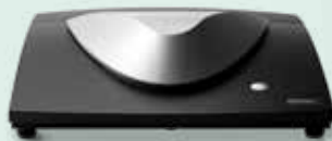
Affinity 2.0 The integrated fitting solution