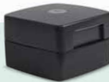
TBS10 Test box