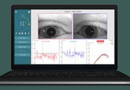
Caloric test with the VisualEyes™515/525 software