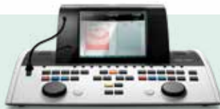
AC40 Clinical audiometer