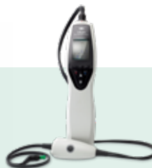
Titan Middle ear analyzer