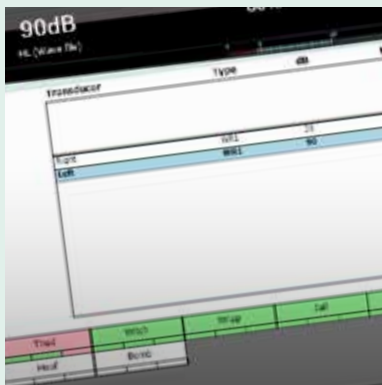
Speech test available in both table and graphic mode