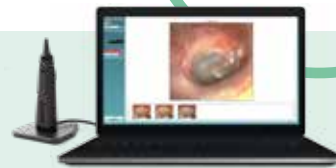
Viot™ Video otoscope