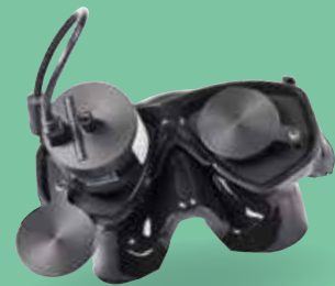
Small face goggle / pediatric