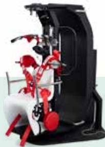
TRV Chair Diagnosing and treating Benign Paroxysmal Positional Vertigo (BPPV)