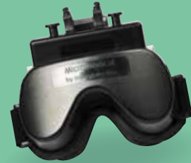
Top mounted cameras goggle w/start button

A goggle solution for the needs of every clinic