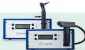
Air Fx & Aqua Stim Versatile caloric air and water irrigators