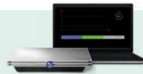
Eclipse Combine VEMP with the Interacoustics VNG system for a complete balance system