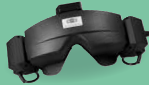
Side mounted cameras goggle w/foam inserts

A goggle solution for the needs of every clinic