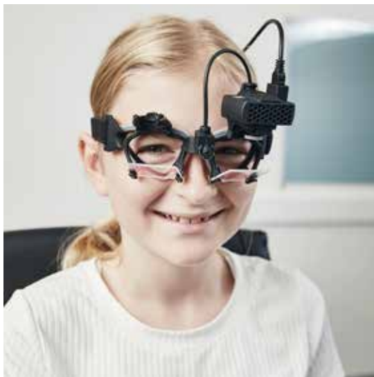
EyeSeeCam vHIT module