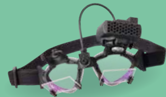
EyeSeeCam vHIT goggle