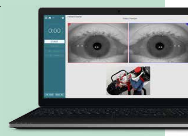
The TRV chair works via Video Frenzel software from Interacoustics (VisualEyes 505)

The TRV Chair works via the Interacoustics VisualEyes 505 software module and can also utilize an external large display to monitor (and record) eye movements.