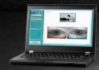
Synchronized videos of eye movements and patient movements