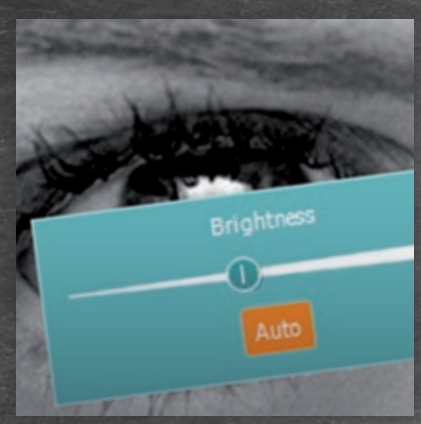
Automatic or manual camera brightness adjustment

VF405 provides ideal conditions for fixation-free observation and recording of eye movements during