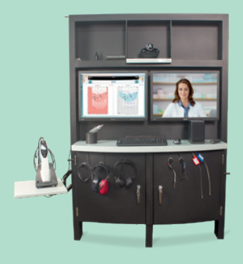
RAS Shown with tympanometry accessory table option.

Telehealth meets audiology Configure RAS your way Audiometry, fitting REM/VSP, impedance