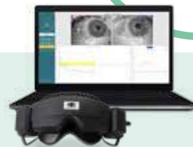
VisualEyes 525 Complete VNG solution for balance assessment