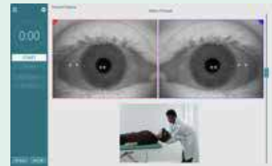
Synchronized videos of eye movements and patient movements