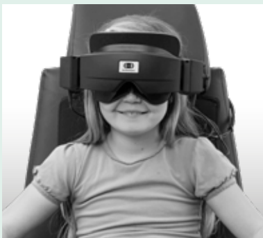
USB cameras with a variety of goggle options