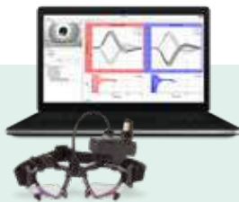
EyeSeeCam vHIT Video Head Impulse Test