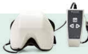
Virtual SVV Subjective Visual Vertical