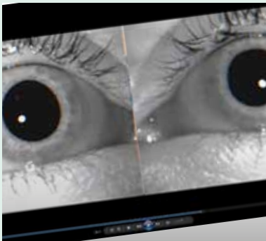
Easy capability to export videos

The USB cameras connect directly to a laptop or a desktop computer. Infrared illumination and high resolution cameras with focus adjustment allow for superior image quality.