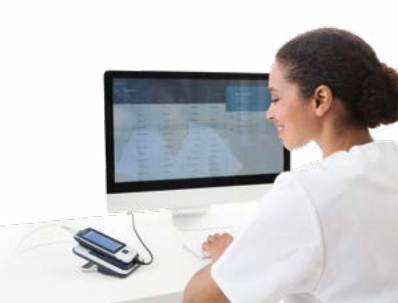
Use easyScreen's convenient cradle for wireless charging while managing your data.

Small but powerful - advanced test methods and algorithms achieve accurate results quickly