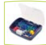
Sanibel eartip starter kit