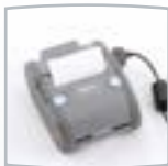
Wireless label printer