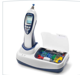
easyTymp™ cradle with eartipbox