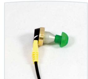
CIR55 (contralateral earphone)