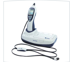
easyTymp™ Pro with printer