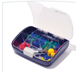
eartips – Use only Sanibel disposables to achieve optimal test results