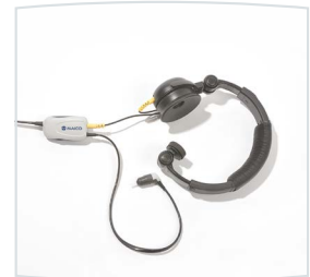
Contra probe with DD45 contralateral headset