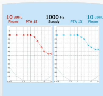
Test results of a dual audiogram