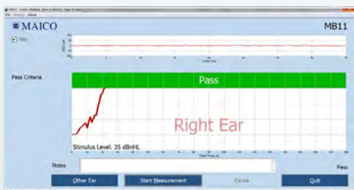
Patented chirp stimulus and advanced response detection algorithm allow fast test times.