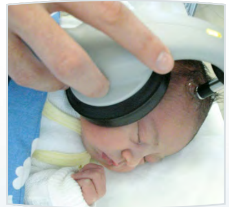
Position the BERophone® ear cushion around the baby's ear, resting the electrodes on the prepared sites