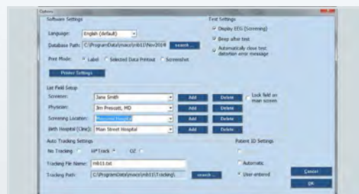
Oz and HiTrack compatible export functions available.