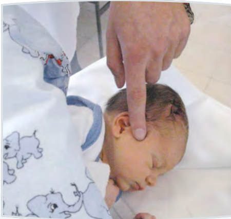
Apply electrode gel at the 3 electrode sites on the baby's head