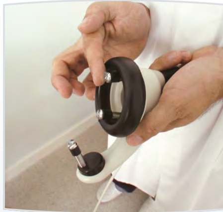
Place a drop of electrode gel on the integrated electrodes