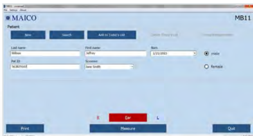
Simple user interface enhances ease of training.