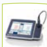
touchTyp with printer