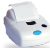
Wireless battery printer (optional)