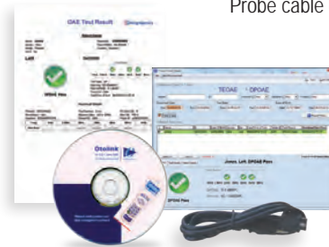
Otolink PC software and download cable