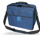
Otoport case (optional)