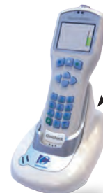
Full docking station, connects to printer, PC and charger (optional)