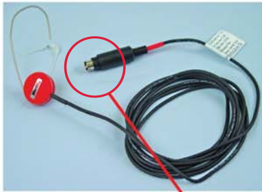
Right Probe Mic