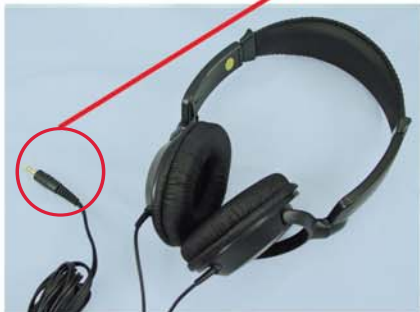
REM Speech Headphones