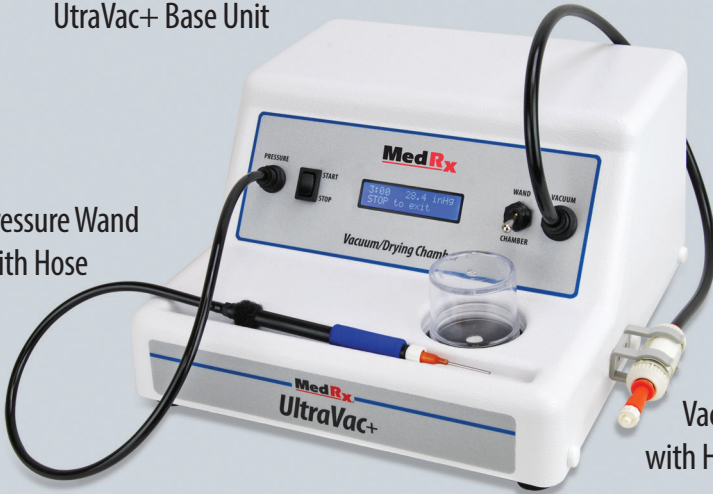
Vacuum Wand with Hose & Filter