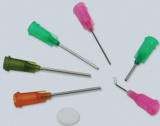
6 Vacuum Wand Tips & Drying Chamber Filter