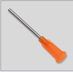
Part# 8514319 Vacuum Tip #15 Gauge with Safety Lock Attachment .059" x 1"

Single use for the UltraVac+ tips ensure the highest level of sanitation. Cross contamination is eliminated with single use. To ensure proper seal MedRx supplied tips are recommended.