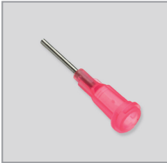
Part# 8514322 Vacuum Tip #18 Gauge with Safety Lock Attachment .038" x 1/2"