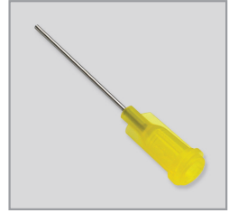
Part# 8514325 Vacuum Tip #20 Gauge with Safety Lock Attachment .025" x 1"