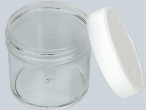
Drying Chamber Cup