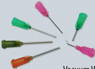
Vacuum Wand Tips