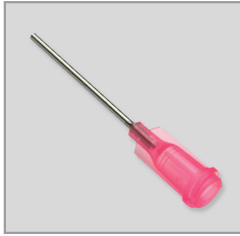
Part# 8514321 Vacuum Tip #18 Gauge with Safety Lock Attachment .038" x 1"