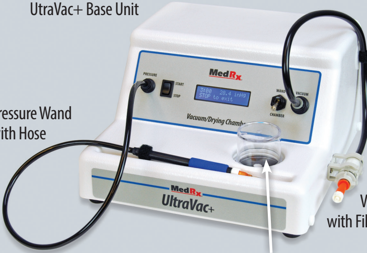
Vacuum Wand with Filter Assembly