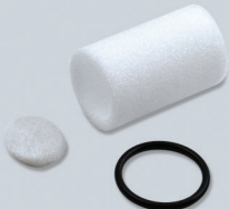
Drying Chamber & Vacuum Wand Filters with O-ring