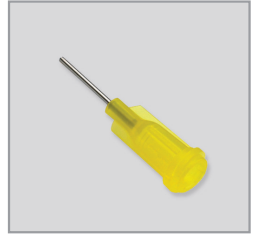
Part# 8514324 Vacuum Tip #20 Gauge with Safety Lock Attachment .025" x 1/2"