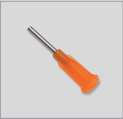
Part# 8514320 Vacuum Tip #15 Gauge with Safety Lock Attachment .059" x 1/2"