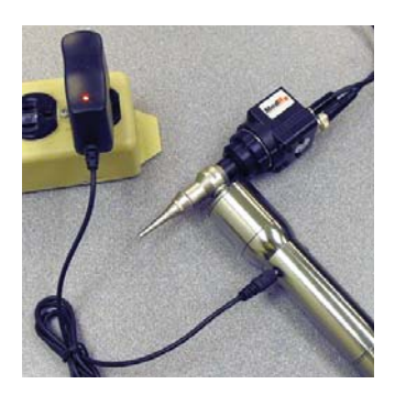
Connect charger to power outlet and plug small round connector into the hole on the side of light handle. (Note: light on top of the charger is orange when charging)