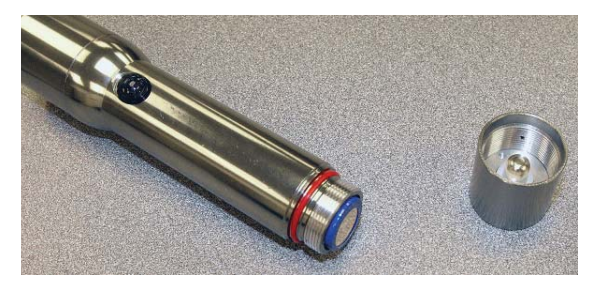
End cap removed showing battery in place. In normal use, the rechargeable battery will not need to be removed.