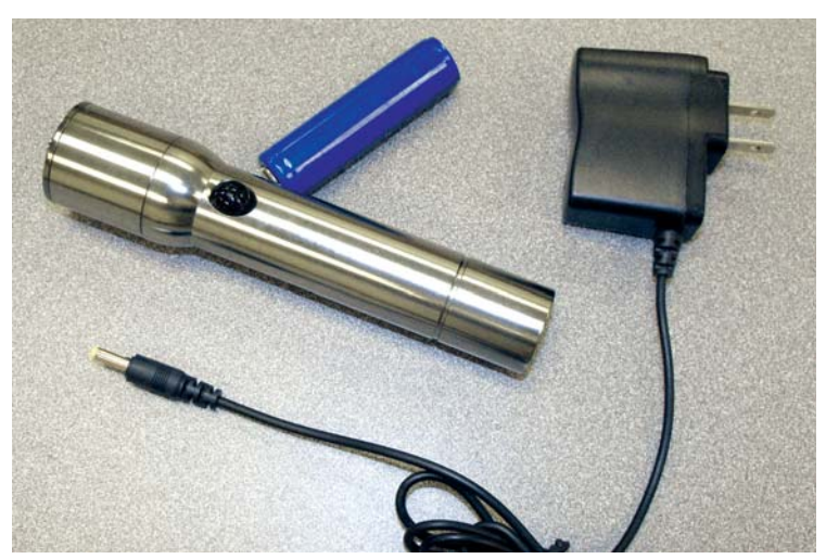
The LED light handle has three components: the Silver Light Handle, the Lithium-Ion battery (3.6 volt, rechargeable) and the Charger for the battery.