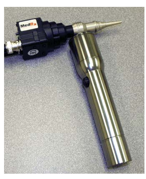
LED light handle installed on Otoscope. (Note: Black button to turn the light on and off)