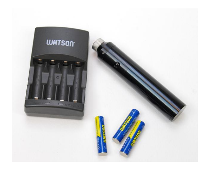
The LED light handle has three components: the Black Light Handle, the rechargeable batteries and the Battery Charger.