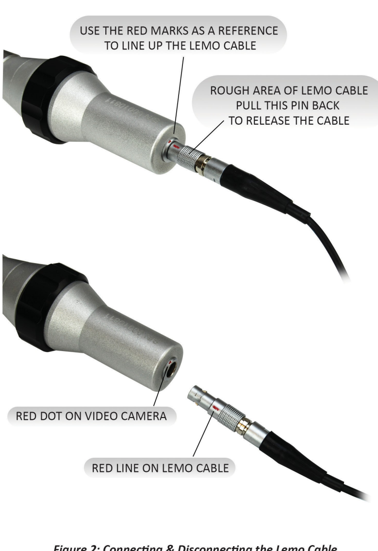
Figure 2: Connecting & Disconnecting the Lemo Cable

This is a safety feature so the cable is not pulled out in the middle of an examination.