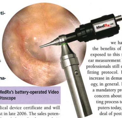
MedRx's battery-operated Video Otoscope

MedRx We do our best to explain to the audiologists that live speech mapping uses the voices of the clinician or patient's family member for real ear measurements. The live speech map is presented in an easily understood graphic, empowering the patient with a clear visual perspective of the hearing loss and aided benefit as they relate to actual speech. Clinicians using live speech mapping report patients have greater confidence in the hearing rehabilitation process due to the exceptional counseling features of the approach. They also report a reduction in follow-up visits required, lower practice costs, and lower costs for the patients. The time saved in fitting the hearing instrument allows the audiologist to devote more time to patient counseling and aural rehabilitation and other clinical functions.