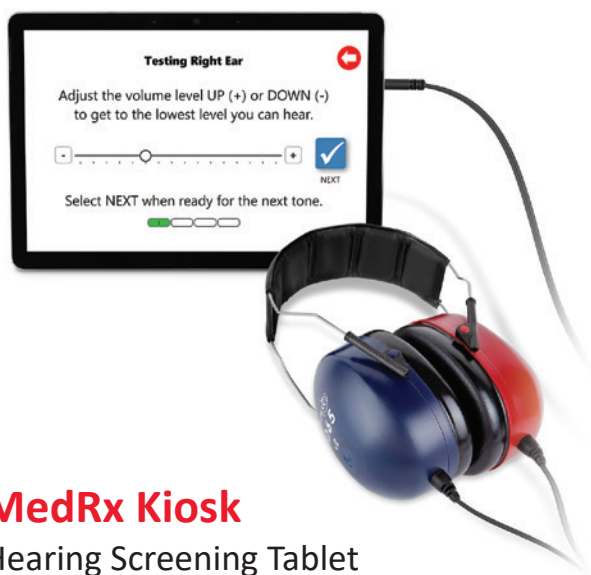
MedRx Kiosk Hearing Screening Tablet