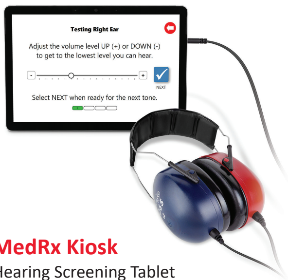
MedRx Kiosk Hearing Screening Tablet