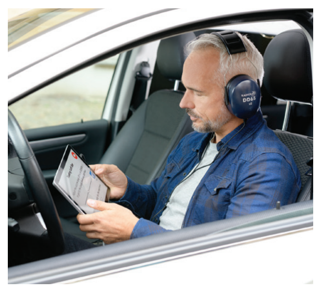
Suited for Home Testing or Drive-Up Testing.