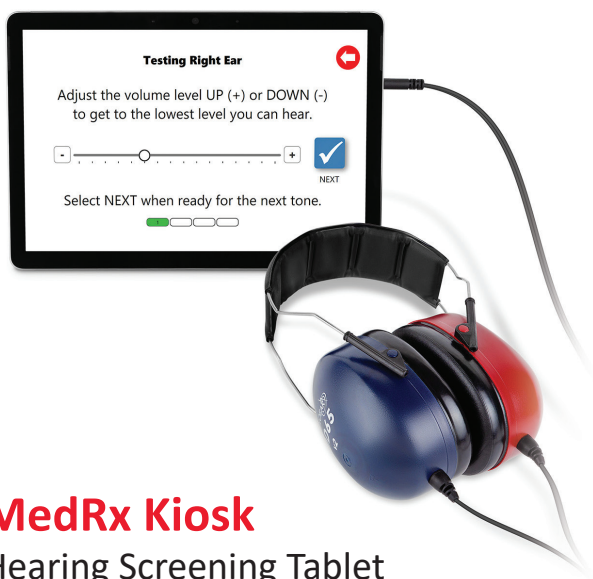
MedRx Kiosk Hearing Screening Tablet