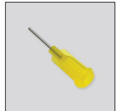
Part# 8514324 Vacuum Tip #20 Gauge with Safety Lock Attachment .025" x 1/2"