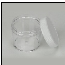
Part# 8111310 Drying Chamber Cup