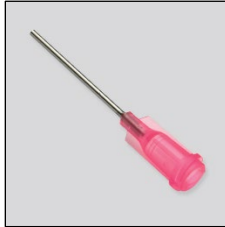
Part# 8514321 Vacuum Tip #18 Gauge with Safety Lock Attachment .038" x 1"