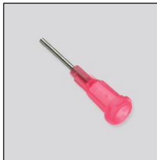
Part# 8514322 Vacuum Tip #18 Gauge with Safety Lock Attachment .038" x 1/2"