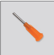
Part# 8514320 Vacuum Tip #15 Gauge with Safety Lock Attachment .059" x 1/2"