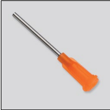
Part# 8514319 Vacuum Tip #15 Gauge with Safety Lock Attachment .059" x 1"

Single use for the UltraVac+ tips ensure the highest level of sanitation. Cross contamination is eliminated with single use. To ensure proper seal MedRx supplied tips are recommended.