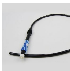
Part# 8111305 UltraVac+ Pressure Wand Assembly