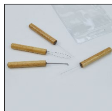
Part# 8111307 4-Piece Cleaning Tool Kit