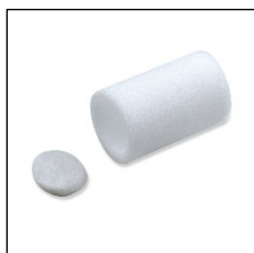
Part# 8505126 Drying Chamber Filter Part# 8506932 Vacuum Wand Filter

Give us a call when you need parts for your UltraVac+