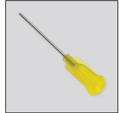
Part# 8514325 Vacuum Tip #20 Gauge with Safety Lock Attachment .025" x 1"