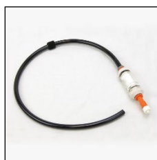
Part# 8507302 UltraVac+ Vacuum Wand Assembly