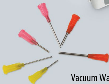
Vacuum Wand Tips