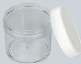
Drying Chamber Cup