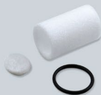
Drying Chamber & Vacuum Wand Filters with O-ring