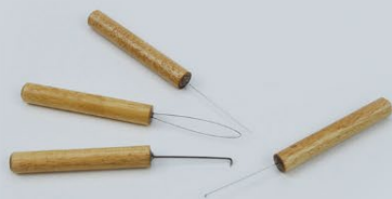
Cleaning Tool Kit