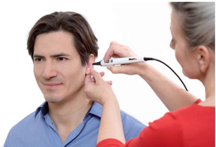
View the Probe Microphone Tube in the Ear Canal.