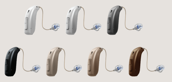
*Please note: Oticon CROS is not compatible with Oticon Opn S 3 and Oticon Opn Play 2