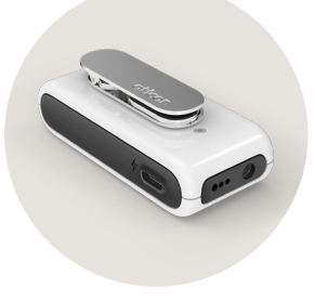
EduMic can be worn as a remote microphone for the teacher to communicate directly with the child.