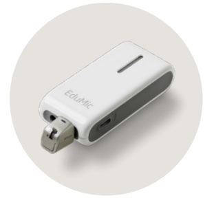
EduMic links Oticon hearing aids to existing remote microphone systems in the classroom using a standard Europin connector.