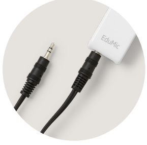
Use the 3.5 mm audio jack to stream sound from a computer, smart board or tablet directly to the child's hearing aids.