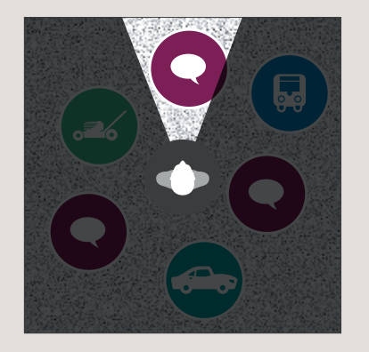
Traditional directionality - focusing on one speaker, while suppressing all other sounds.