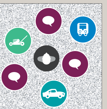
Traditional omni-directional technology – giving equal access to speech and noise, which limits speech understanding in noise.