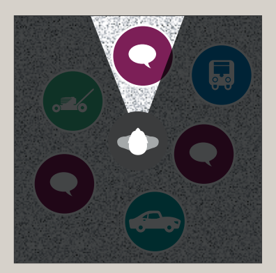
Traditional directionality – focusing on one speaker, while suppressing all other sounds.