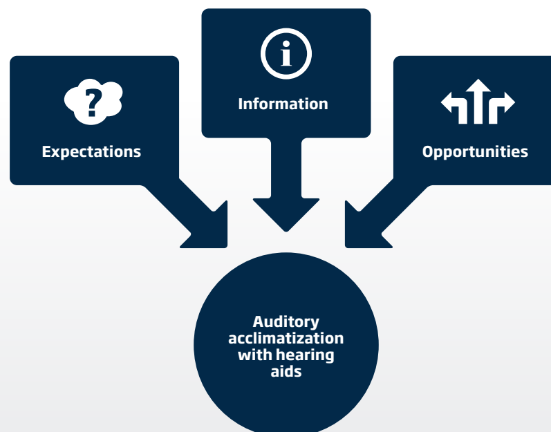
Figure 1. Facilitators for auditory acclimatization with hearing aids

For participants in this study, having the audiologist set expectations for the hearing aid was crucial. Participants relied on their hearing aids for learning, social activities, and communication at home and in their community. They wanted to understand the impact these new hearing aids may have on these activities. The teens wanted the audiologist to use simple, concrete language that was easy to understand, describe how the hearing aids may sound when activated, and have expectations for adjustment time explained. Sharing examples of other children's experiences when getting new hearing aids from another manufacturer were described as very helpful. One teen described why these facilitators for auditory acclimatization were so important: