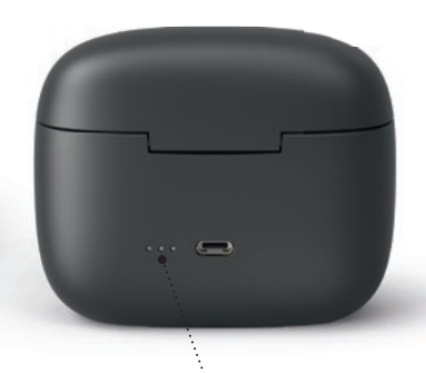
Battery indicator Displays charging status of the power bank/power bank battery levels