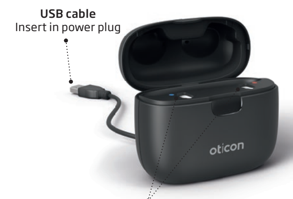
Charging ports For hearing aids when charging