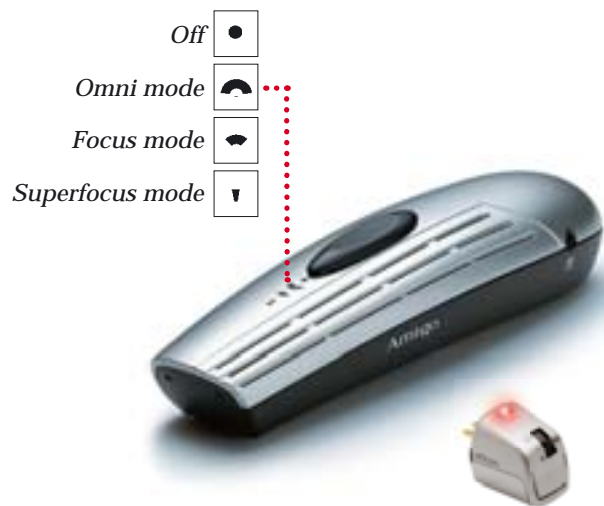
Amigo T10 transmitter and R2 receiver, the portable FM solution

Another advantage of digital processing is that the amount of boost given is carefully calculated to match your hearing abilities and listening preferences.