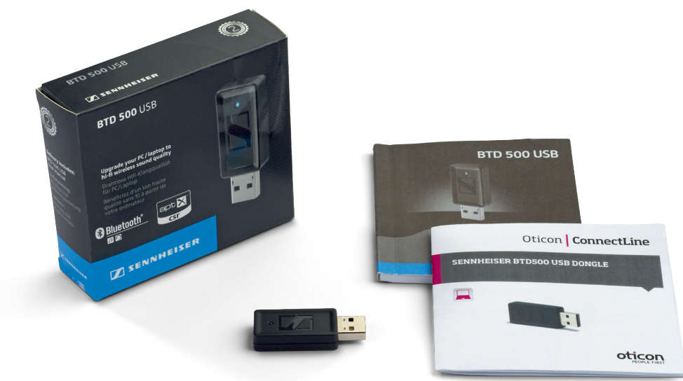
Sennheiser BTD500 USB Dongle

For up-to-date information about compatibility issues, please visit www.oticonusa.com/connectline.