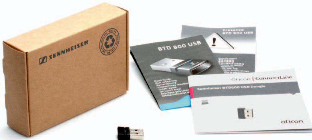
Sennheiser BTD800 USB Dongle