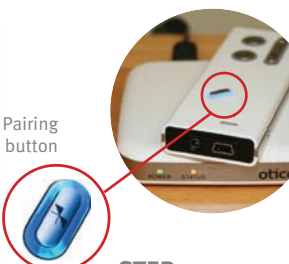
STEP 1: Place Streamer close to adaptor. Press pairing button until blue light flashes rapidly.

NOTE: Before pairing, charge Streamer or attach to power supply.