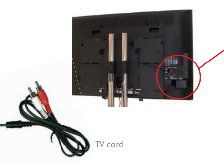
Streamer & Pairing