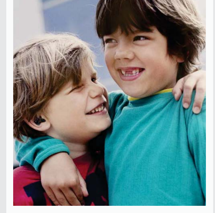
Get and give hugs without annoying whistling sounds -Inium Sense feedback shield<sup>sp</sup> effectively controls whistling sounds

Contact your hearing care professional to learn more about Sensei Super Power.