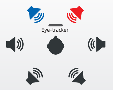
Figure 1. Test setup with a total of six loudspeakers, which is identical to the setup used in the Oticon More EEG study (Santurette et al., 2020). Pupillometry was done by placing an eye-tracker in front of the participants to measure sustained listening effort. Two frontal loudspeakers (blue and red) contained a male and a female talker reading audio clips simultanouely. Background noise, which is a 16-talker babble, came from the remaining four loudspeakers.

A common challenge among people with hearing loss is the effort it takes to listen. They often complain about being "exhausted" or "drained" from listening in noisy environments. Previous studies reported that even a mild hearing loss could lead to increased listening effort (Rabbit, 1991; McCoy et al., 2005). This happens because when hearing is compromised, the auditory system becomes more vulnerable to noise and disturbing sounds. The brain needs to work harder to hear in noise, which leads to tiredness and exhaustion. Indeed, researchers have found that people with hearing loss needed more time at the end of the day to rest and to recover from work (Nachtegaal et al., 2009).