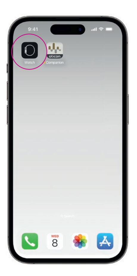
Open the Watch app on your iPhone.

First, download the Oticon Companion app from the App Store on your iPhone and pair your hearing aids with your iPhone.